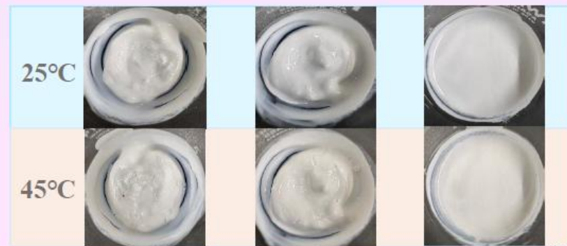
Cetyl Ethylhexanoate Isodecyl Neopentanoate AMITER MA-HD